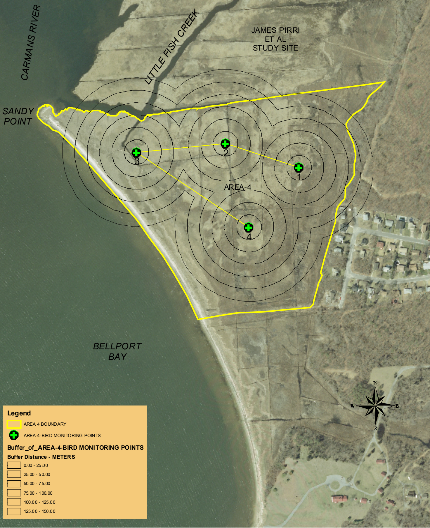
FIGURE 8d SUFFOLK COUNTY VECTOR CONTROL OPEN MARSH WATER MANAGEMENT DEMONSTRATION PROJECT AREA 4 BIRD SURVEY POINTS