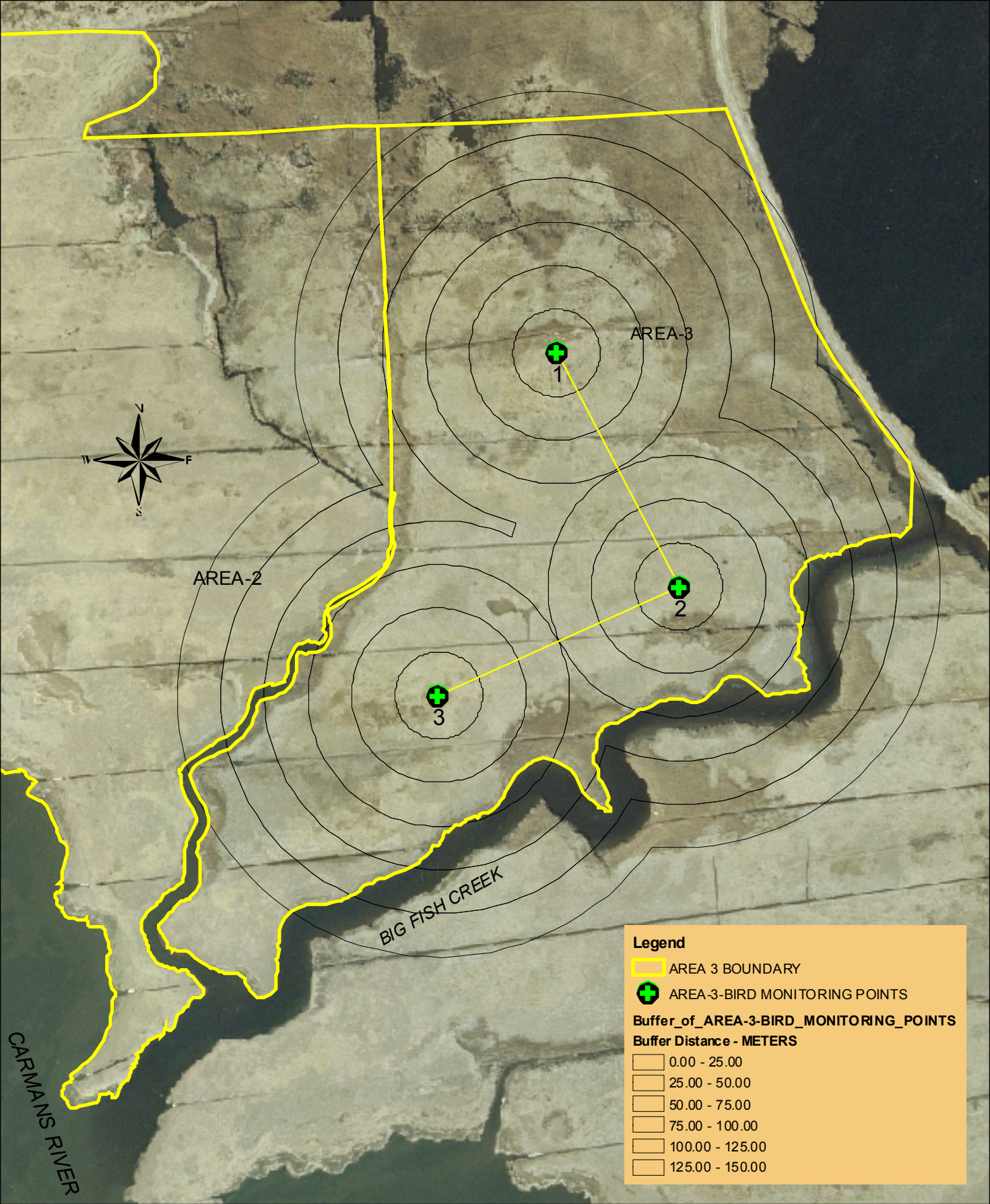
FIGURE 8c SUFFOLK COUNTY VECTOR CONTROL OPEN MARSH WATER MANAGEMENT DEMONSTRATION PROJECT AREA 3 BIRD SURVEY POINTS